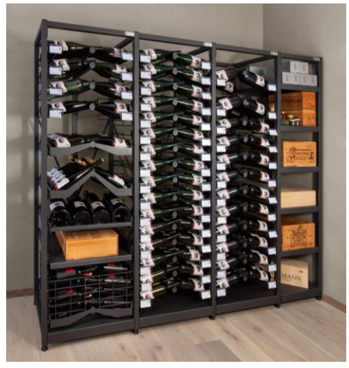
Xi Rack assembled with full range of accessories