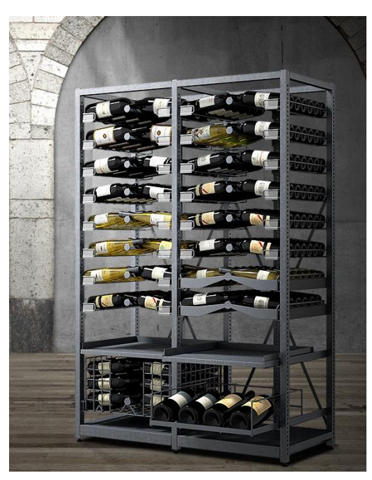
Xi Rack Basic & extension (sample picture)