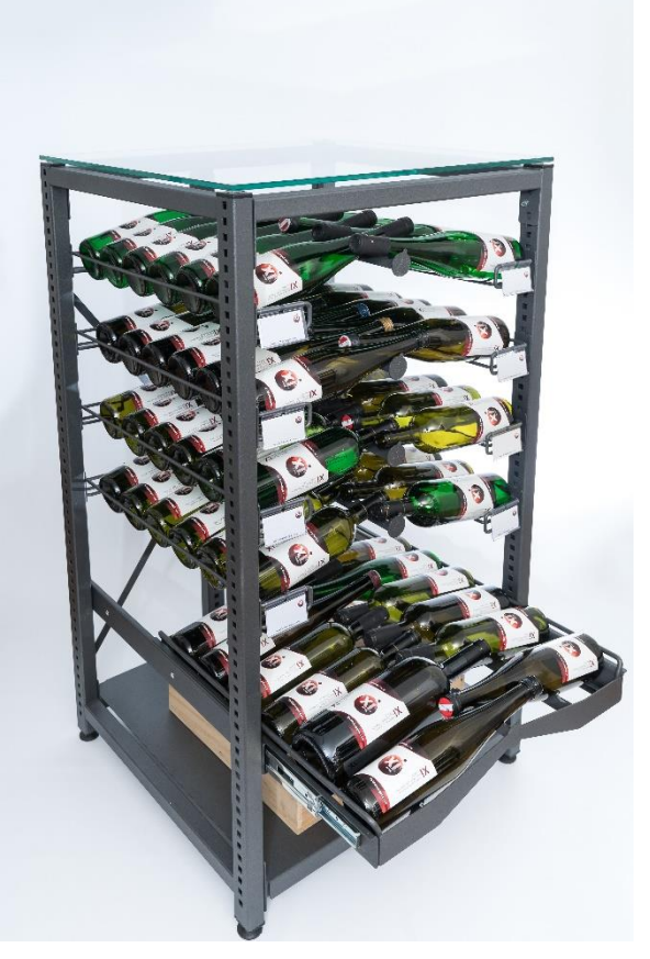
Xi Counter (sample picture)