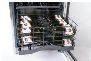
Bulk store up to 40 bottles