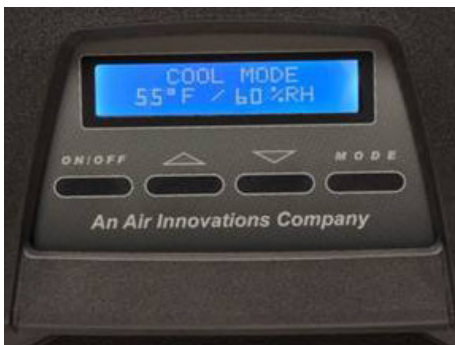
Front Digital Display