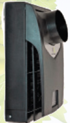
Back View With Optional Duct Adapter