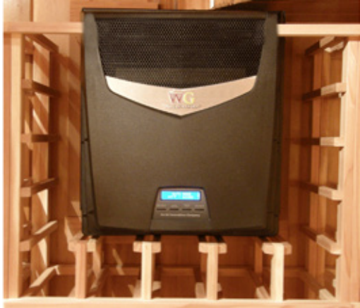
Front View in Racking