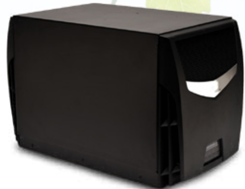
TTW unit out of racking