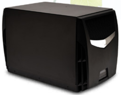
TTW unit out of racking