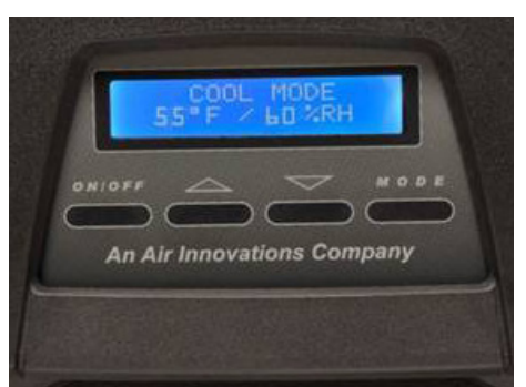
Front Digital Display