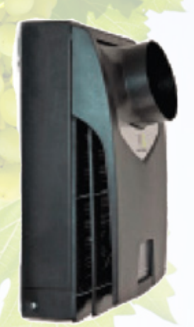
Back View With Optional Duct Adapter