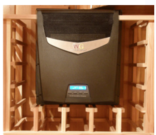
Front View in Racking