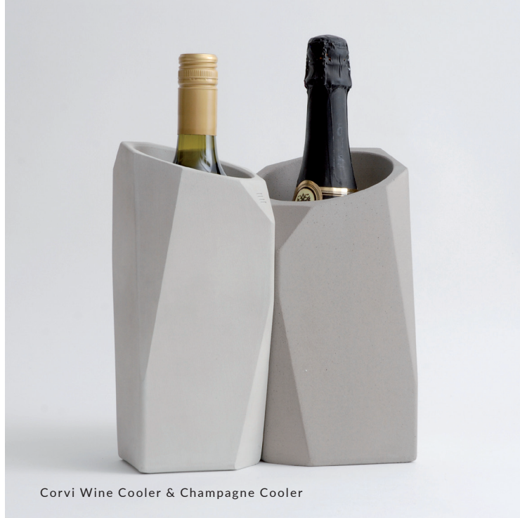
Corvi Wine Cooler & Champagne Cooler