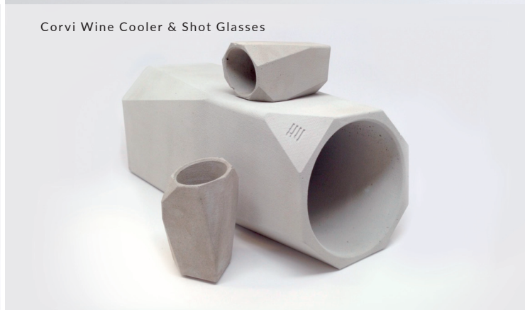
Corvi Wine Cooler & Shot Glasses