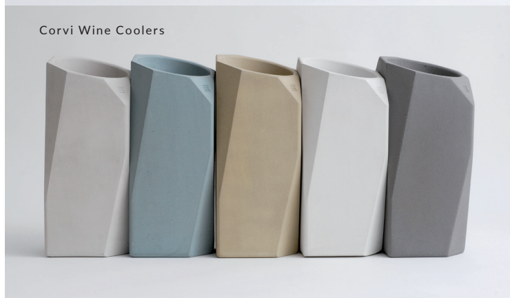
Corvi Wine Coolers