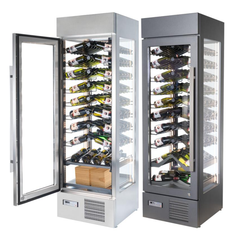
Xi Cool Premium stainless steel (standard, left), RAL powder coated (right) (Sample pictures)